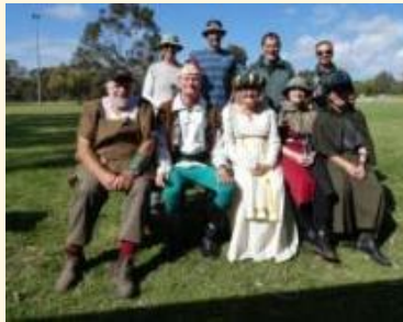
AAC archers in their finery