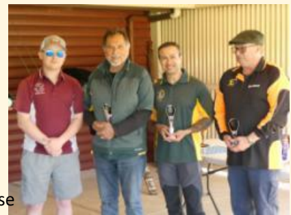
Gentlemen Longly Longbow winners