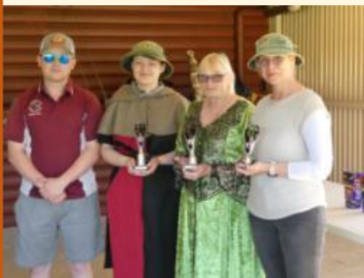
Lady Longly Longbow winners