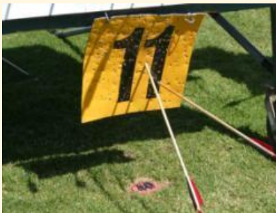
Steve was hoping to score 22 for these aluminium-piercing arrows!