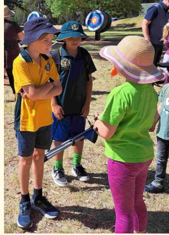
Our two youngest volunteers welcome two even younger guests